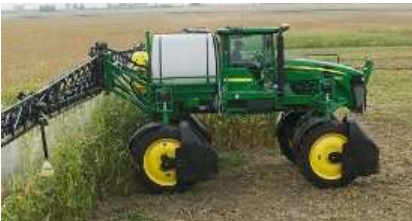
Sprayer equipped with wheel shields

To maximize productivity and minimize crop damage in 762-mm (30-in.) rows, wheel shields are highly recommended for use in tall corn or other tall crops. Wheel shields help prevent damage from the wheels, hubs, and tires as the sprayer moves through the field by providing a smooth surface for the crop to flow past the sprayer's wheel package.