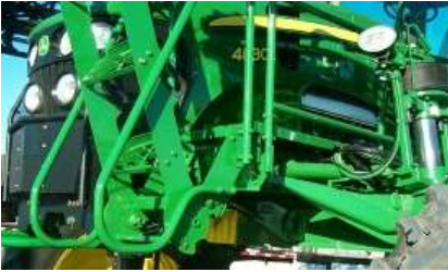
Increased height on hinge point

Entry ladder modifications bring the hinge point out of the crop while the ladder is folded and moving through the field. Two additional steps are included in the bundle to lower the first step while the ladder is in the unfolded position.