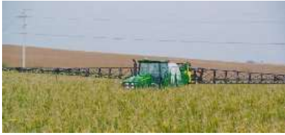
Spraying tasseled corn