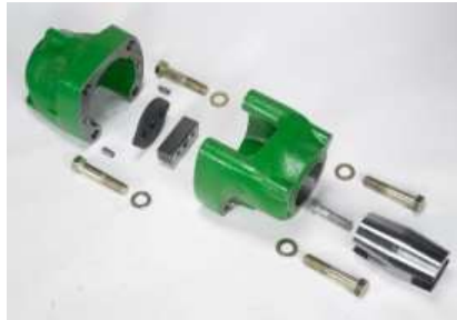
Lift casting contents

Lift castings are designed to give operators an additional another application with existing sprayers. These castings fit between the current wheel motor housing and chrome spindle, as shown in the picture.