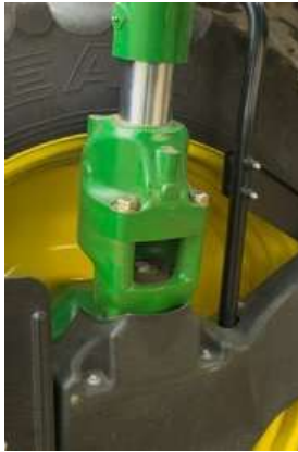
Structures to lift sprayer