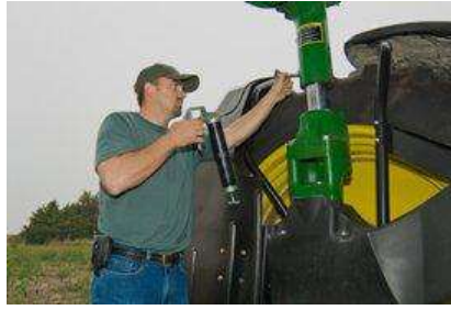
Additional height provided by lift castings

The high-clearance bundle consists of four assemblies (one per wheel) that attach between the chrome spindle and the casting that houses the wheel motor. These castings are designed to give the sprayer an additional 406 mm (16 in.) of clearance while still allowing the wheels to be set at 3.05 m (120 in.) when the tread setting is all the way in.